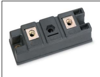
QRS0640T30 Fast Recovery Diode Module 400 Amperes/600 Volts